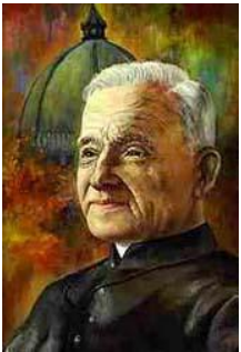
Brother André - model of charity and generous service.

The Knights of Columbus was founded by Father Michael J. McGivney, a New Haven parish priest, in 1882. It has grown into the world’s largest lay Catholic organization, with more than 1.8 million members throughout North and Central America, the Philippines, the Caribbean islands and Poland.